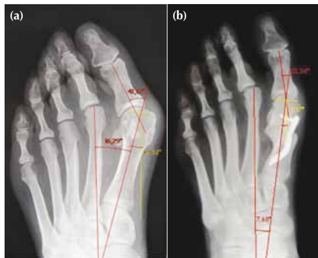
Figure 2 In a patient with moderate hallux valgus: (a) the first metatarsal is shorter than the second metatarsal before surgery. (b) After distal oblique metatarsal osteotomy and fixation by the Endolog system, the first metatarsal is shortened. A linear osteotomy and a percutaneous lateral soft tissue release should be more appropriate.